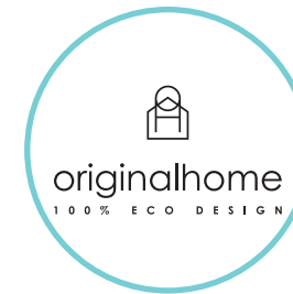
Original Home Company, The Netherlands