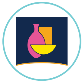
Bunnik Creations, The Netherlands.